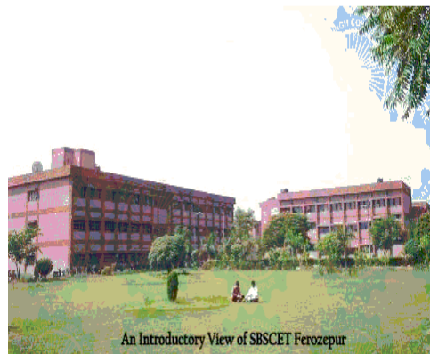
Figure.6. Watermarked Image 5 th bit substitution