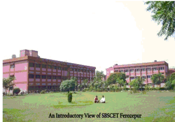
Figure.2. Watermarked Image with LSB