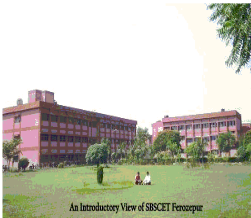
Figure.3. Watermarked Image 2 nd bit substitution