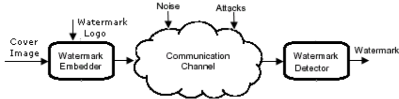
Figure 1.1 Digital Image Watermarking

In digital image watermarking a secret information or logo is embedded in another image in an imperceptible manner. This secret information or logo is called watermark and it contains some metadata, like security or copyright information about the main data/image. The main image in which the watermark is embedded is known as cover image since it covers the watermark. The digital image watermarking system essentially consists of a watermark embedder and a watermark detector as shown in figure 1.1.