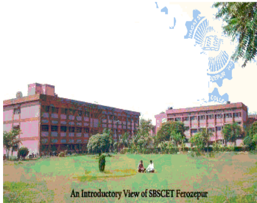
Figure.7. Watermarked Image 6 th bit substitution