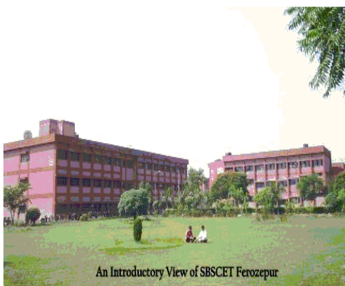
Figure.5. Watermarked Image 4 th bit substitution