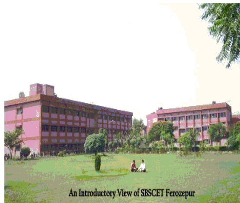
Figure.4. Watermarked Image 3 rd bit substitution