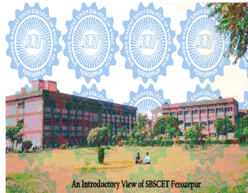
Figure.8. Watermarked Image 7 th bit substitution