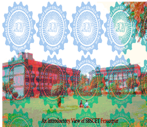
Figure.9. Watermarked Image 8 th bit substitution