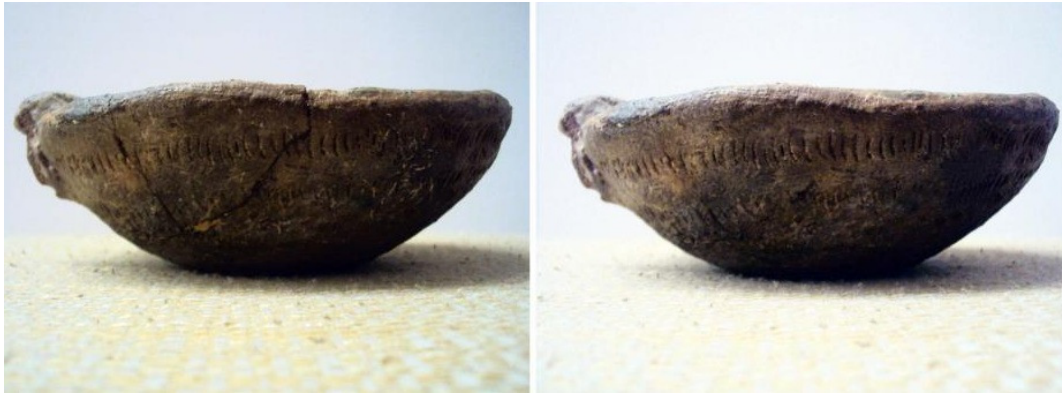
Figure 4. Ceramics MAX, original and restored, by Raquel Figueirôa (2012)

technological product in the area of heritage involves: analysis, design, implementation, testing and validation. Following the acquisition of images or videos it produces a 3D model at 360° in Flash, HTML gift or published in a database on the Internet. In another step inserts the material rotating 360° and 3D environment in the electronic dictionary, linking image / entry and introduction of software as the Dos-vox [10] to promote accessibility for blind people.