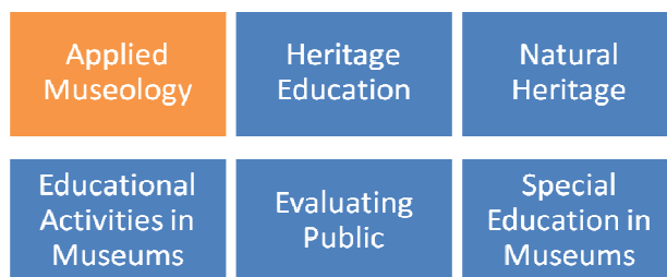
Figure 1. Diagram of Pedagogic Project of undergraduate Museology (UFS)

The methodology for developing the electronic dictionary includes interviews with professionals from various museums; application of thesaurus and rotational and 3D modelling of collections.