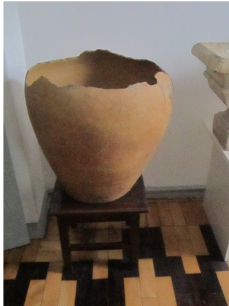
Figure 3. Ceramic urn, Museum Gladino Bicho – SE, by Estefanni Patricia Santos (2012)

Considered one of the first museums of Sergipe, created in 1912, the institution has a funerary urn up military outfits, thus building an environment that gathers facts that underscore the memory of Sergipe.