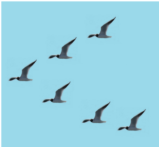
Figure 3. Birds in leader-follower formation

Most of the multi-agent formation control researches have been carried out with leader-follower scheme. This is a concept taken from nature and an example can be seen in the formation flight of a birds swarm (Figure 3). With this approach, some vehicles are designated as leaders while others are treated as followers. For small formations, there may be only one leader. The states of the leader constitute the coordination variable, since the actions of the other vehicles in the formation are completely specified once the leader states are known [6]. This architecture is easier to understand and implement. However, this approach lacks robustness with respect to leader's failure. Though Virtual Leader strategy is also proposed to improve its robustness.