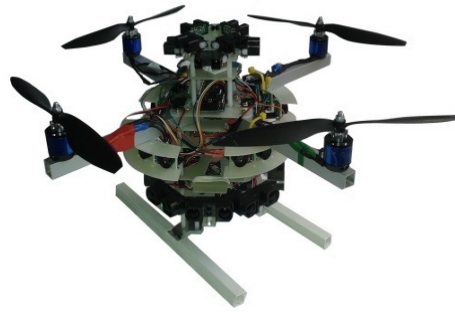
Figure 1. Quadrocopter

Cooperation behaviour of units implies some degree of coupling among the units. Generally speaking, greater the degree of coupling, more challenging it is to formulate effective cooperative solutions [2]. This becomes more obvious taking into consideration that a swarm of MUAVs need to cooperate in a way that it can rescue a person from a burning house as depicted in Figure 2.