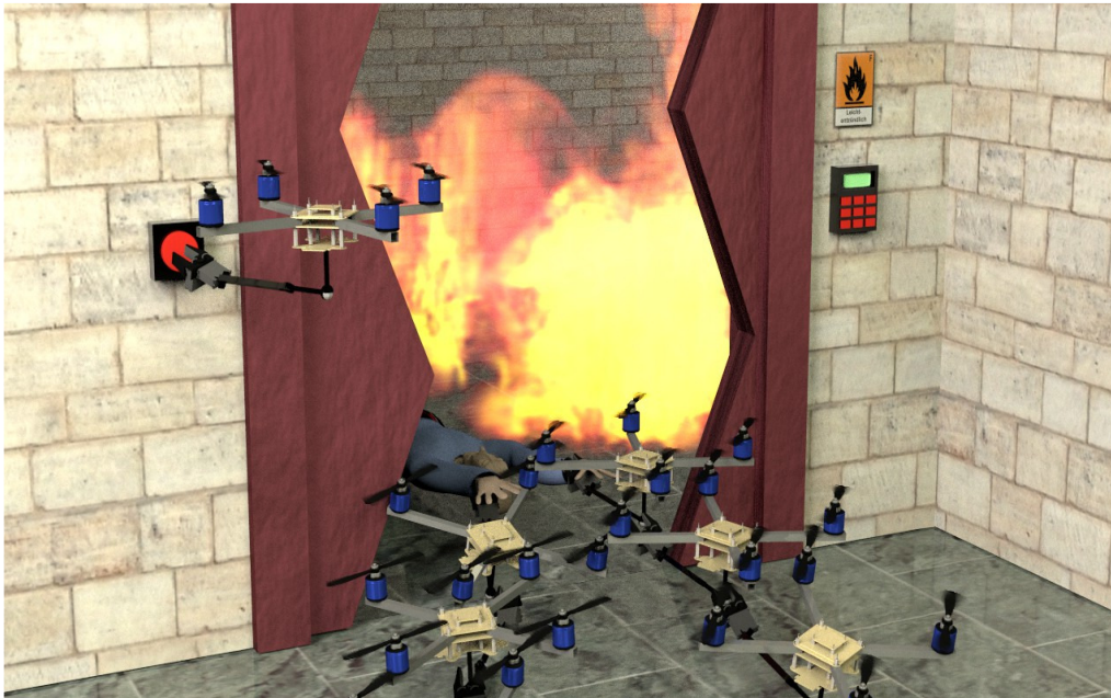
Figure 2. Cooperative emergency quadrocopters

Cooperation behaviour of units implies some degree of coupling among the units. Generally speaking, greater the degree of coupling, more challenging it is to formulate effective cooperative solutions [2]. This becomes more obvious taking into consideration that a swarm of MUAVs need to cooperate in a way that it can rescue a person from a burning house as depicted in Figure 2.