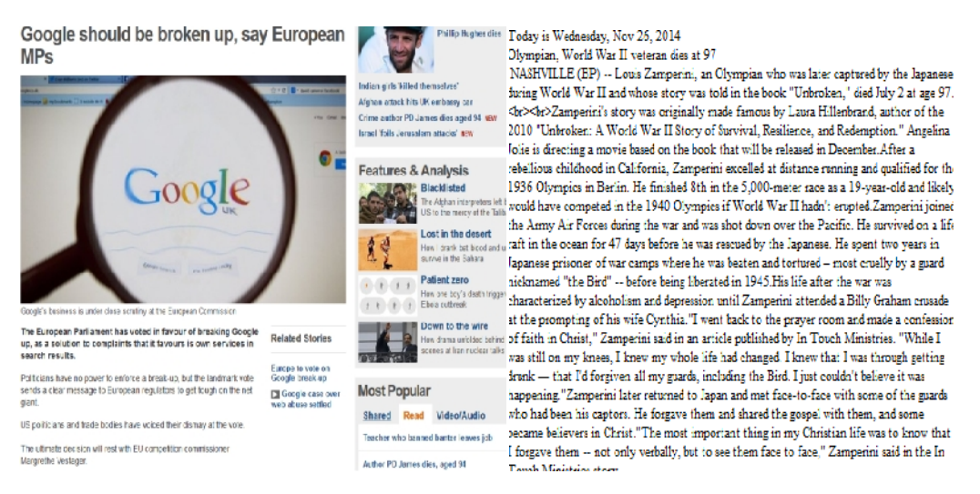
Figure2. Original Web page