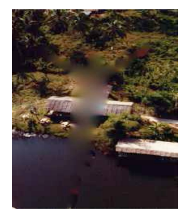
a) PDE Inpainting