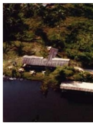
b) Texture Synthesis