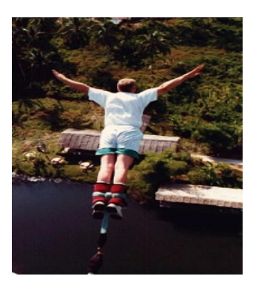
a) Original Image