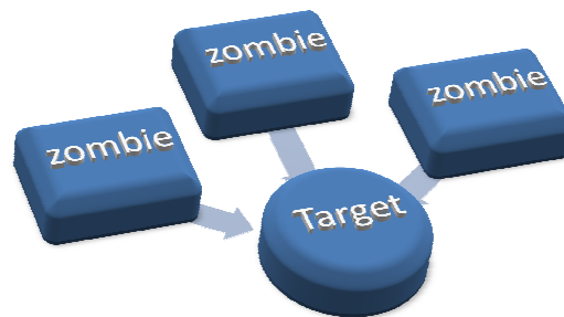
Fig direct flooding attacks

Normally DDoS attacks are happened by overloading the server. the one type of attack is said to be a direct flooding attacks . In direct flooding attacks te zombie machines directly send attacks packets in order to increase the bandwidth. This will decrease the processing capacity of the server and network devices which cause the Denial of Services.