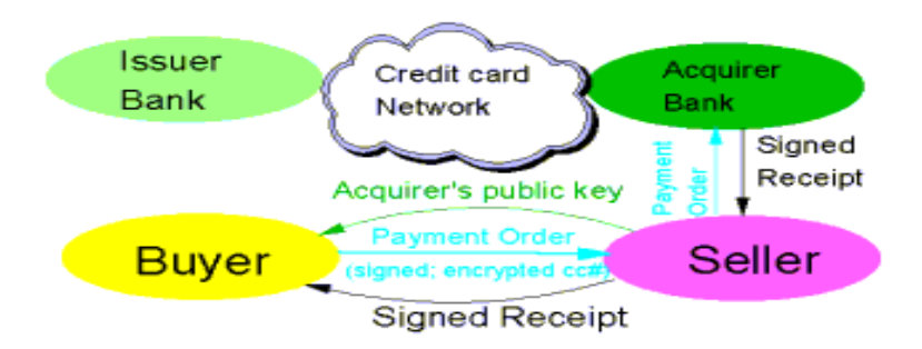
Fig 3: Secure Electronic Transaction using Credit Cart