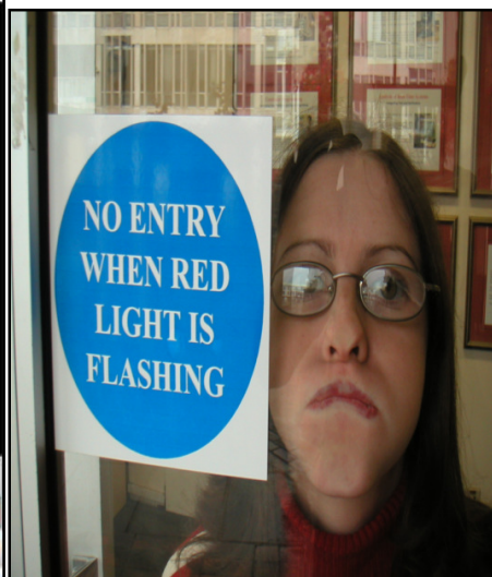
Figure 3: Scene Text Image (ICDAR Dataset)

Due to very fast growth of available multimedia documents and growing requirement, studies in the field of pattern recognition shows a great amount of interest in efficient extraction of text, indexing and retrieval from digital video/document images. Intensive research projects are performed for text extraction in images by many scholars. Text extraction involves detection, localization, tracking, binarization, extraction, enhancement and recognition of the text from the given image. Several techniques have been developed for extracting the text from an image. The proposed methods were based on morphological operators, wavelet transform, artificial neural network, skeletonization operation, edge detection algorithm, histogram technique etc. The methods cited in this paper on text extraction in images are classified according to different types of images.