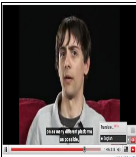
Figure 2: Caption Text Image