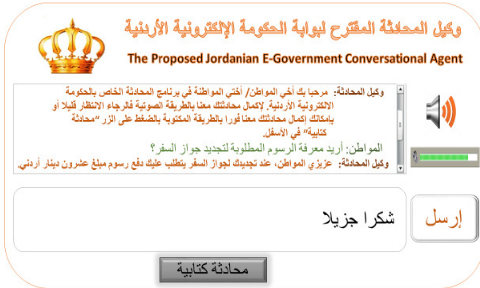
Figure 3: The Suggested user interface for the proposed CA.

patterns to handle the expected conversations successfully. This weakness can be overcome by different ways such as using the stemming technique for the patterns' keywords [43]. The last approach, sentence similarity, overcome the pattern matching problem (having large number of patterns) by having a very few number of patterns for each topic. This approach deals with Arabic semantic datasets such as "WordNet" to check the semantic similarity between words and between the competitor sentences. Finally, it will weight each pattern, and the highest weighted pattern, its response will be considered to the user. Generally, Arabic semantic datasets is still a young research area and needs further effort [36, 44]. It is too risky to depend on this approach to build the proposed CA as the approach itself still needs time/effort to be structured well. In addition, to best of our knowledge, there is now study discussed the computing cost for such approach to compare it with other approaches. The computing cost factor in CAs building is very important as it working in an online environment with a huge number of expected users. As a result, it is not recommended to rely on this approach to build the proposed CA as it totally depends on building a rich well-structured dataset [36]. Figure 3 considered a suggested example of user interface for the proposed prototype of CA.